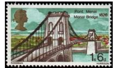
The Menai Bridge of 1826 joins Anglesey to

Many countries have issued commemorative stamps to celebrate this wedding including Canada. We were probably one of the very few British Commonwealth