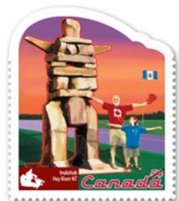
Inukshuk of Hay River,