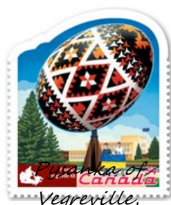
Pysanka of Vegreville,