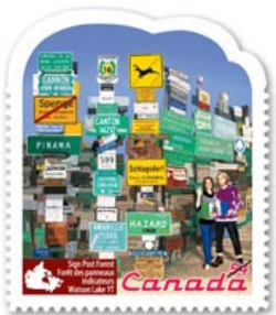
Signpost Forest of Watson Lake,